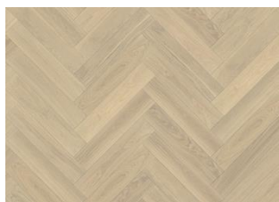
Herringbone Oak AB White