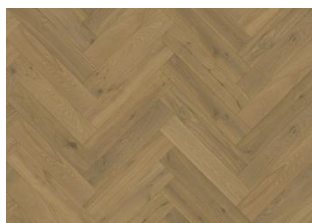
Herringbone Oak CD Grey