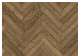
Herringbone Oak CD Smoked