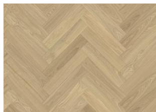
Herringbone Oak AB Dim White