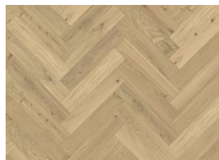
Herringbone Oak CC Dim White