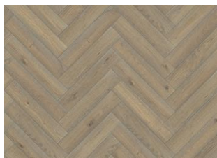
Herringbone Oak CC Vintage White