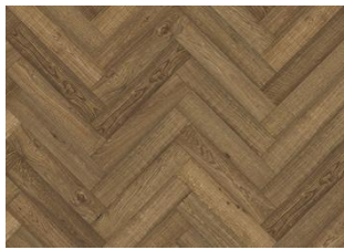
Herringbone Oak CD Smoked