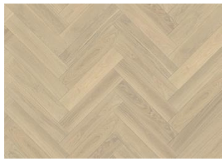
Herringbone Oak AB White