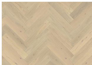
Herringbone Oak CD White